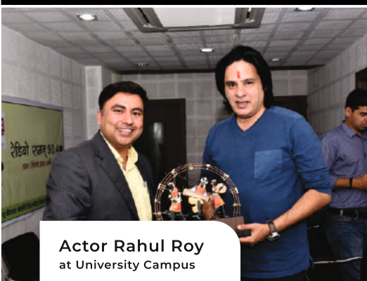
Actor Rahul Roy at University Campus