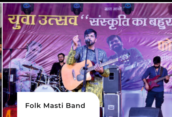
Folk Masti Band