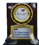
Leading University of Chhattisgarh Award 2019