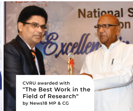
CVRU awarded with "The Best Work in the Field of Research" by News18 MP & CG