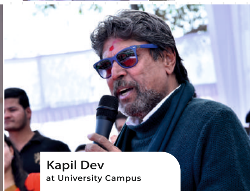
Kapil Dev at University Campus