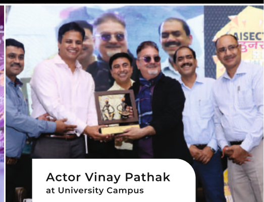
Actor Vinay Pathak at University Campus