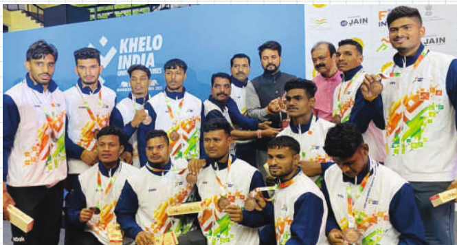
KHELO INDIA UNIVERSITY GAMES: CVRU Men's team receiving the bronze medal by Union Sports Minister Sh. Anurag Thakur in Bengaluru