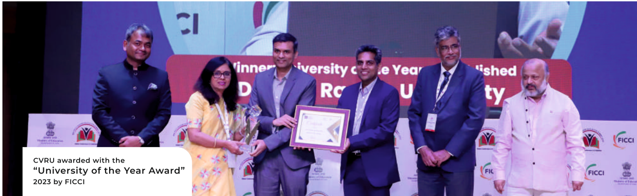
CVRU awarded with the "University of the Year Award" 2023 by FICCI