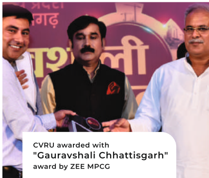
CVRU awarded with "Gauravshali Chhattisgarh" award by ZEE MP/CG