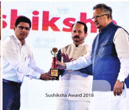
Sushiksha Award 2018