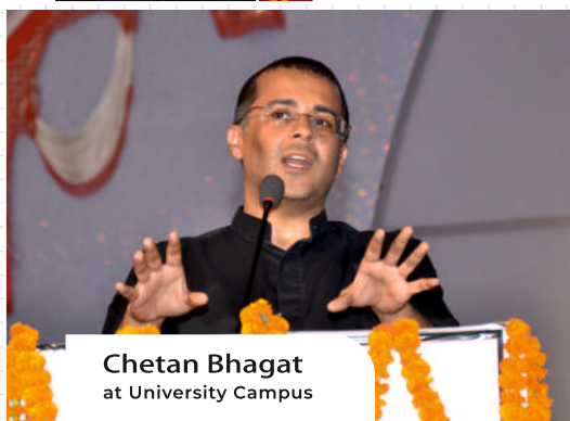
Chetan Bhagat at University Campus